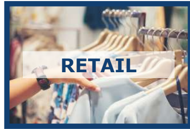
Debenhams Department Store