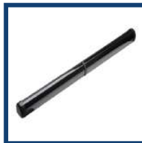
DWSSS-5M1 Infrared Sensor