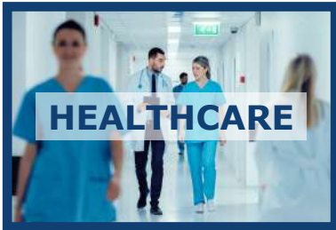
Great Ormond Street Hospital

DIGIWAY is a trusted and reliable solution across the UK in a wide variety of industries, organisations, and building types.