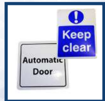
DWS-SIGN Safety Signage