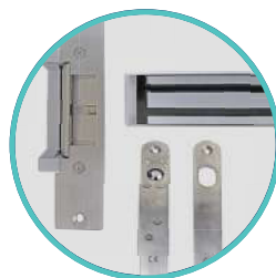
Secure Locking Solutions