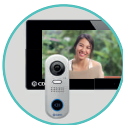
Powerful Video Entry