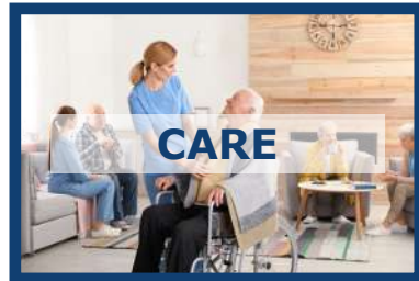
Orchard House Neurological Rehabilitation Centre