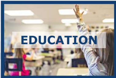
Whitefriars Secondary School