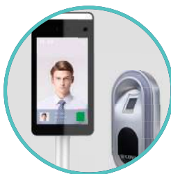
Intelligent Biometric Technology