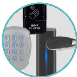
Innovative Access Control